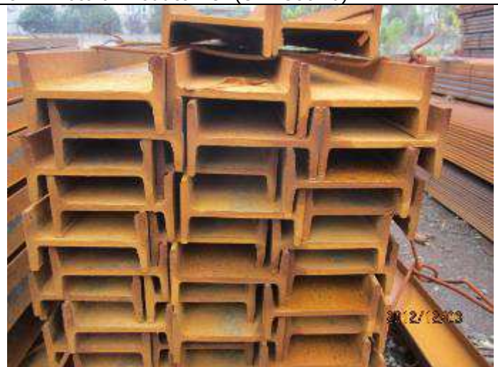
c.4. Photo of Product View(IPN 140)