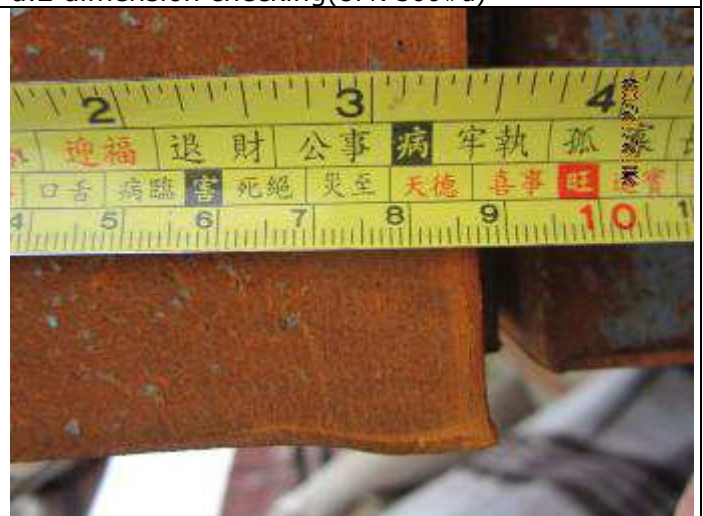
d.4 dimension checking(UPN 300#b)