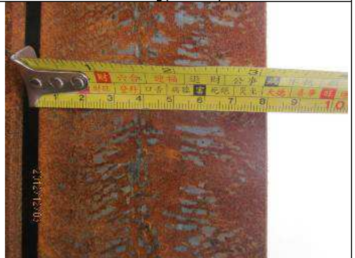
d.8 dimension checking(IPN 140)