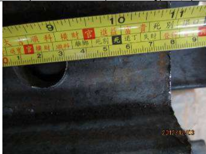
d.15 dimension checking(30KG/M)