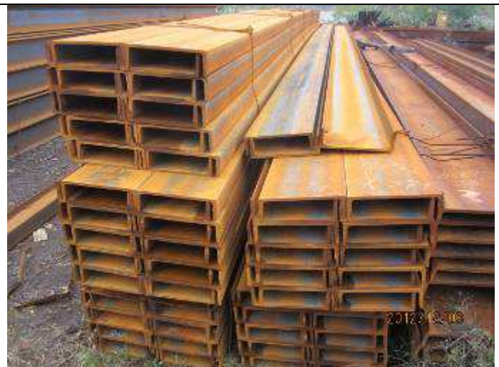
c.2. Photo of Product View(UPN 300#b)