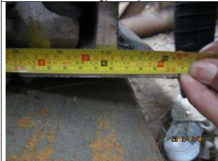
d.9 dimension checking(30KG/M)