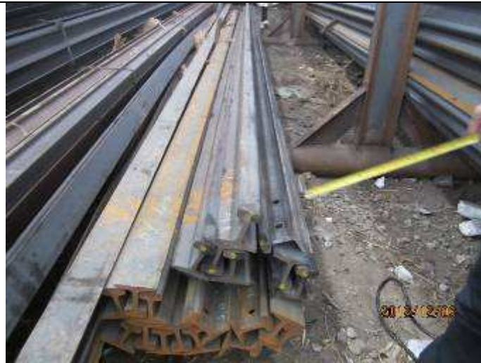
c.5. Photo of Product View(30KG/M)