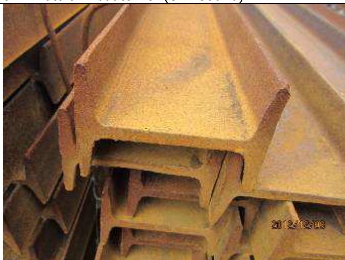
c.3. Photo of Product View(IPN 100)