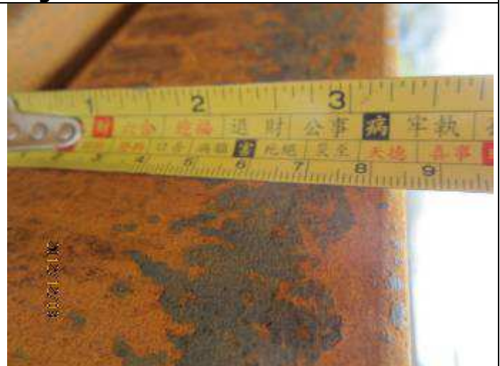
d.2 dimension checking(UPN 300#a)