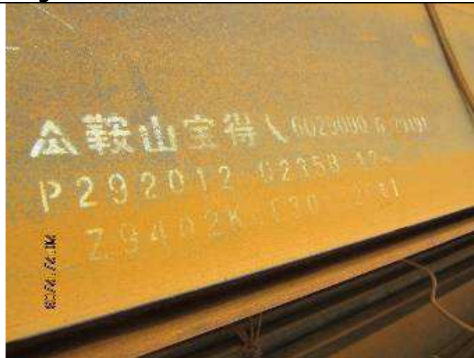
b.1 Labeling(UPN 300)