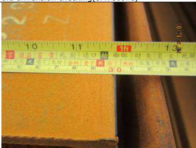
d.3. dimension checking(UPN 300#b)