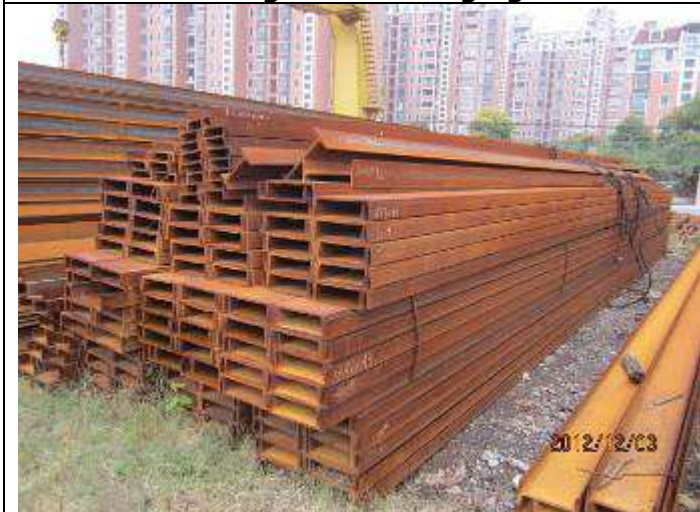
a.1 Product Storage