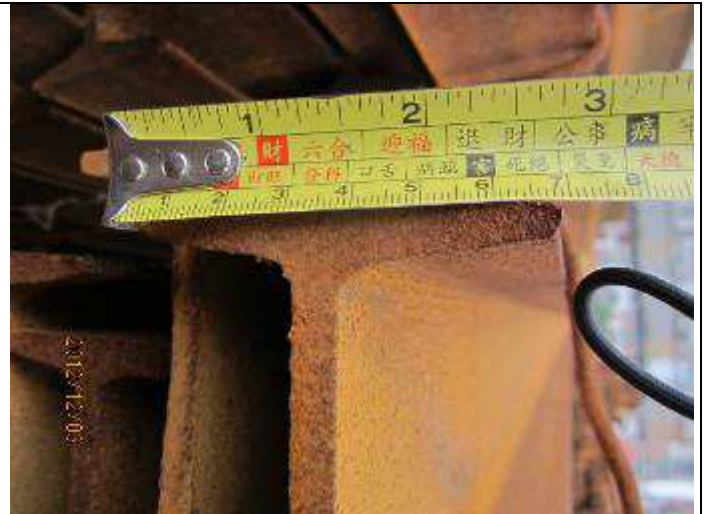
d.6 dimension checking(IPN 100)