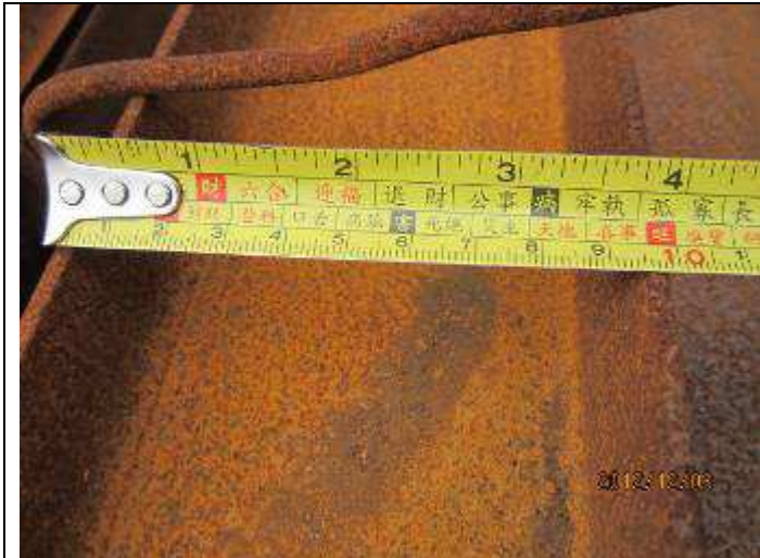
d.5 dimension checking(IPN 100)