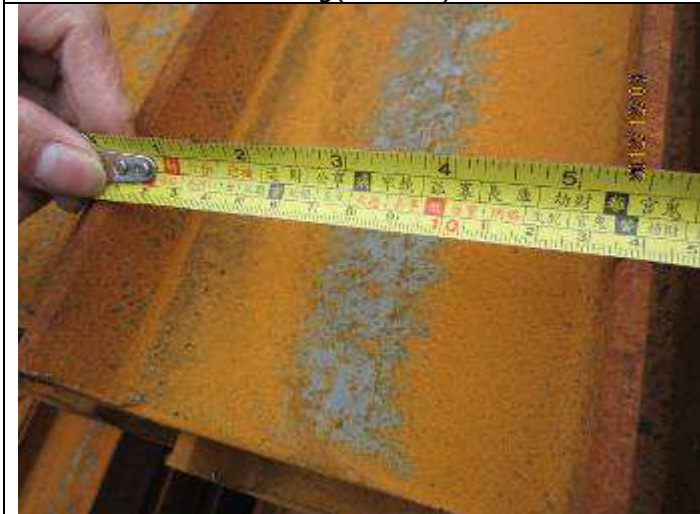
d.7 dimension checking(IPN 140)