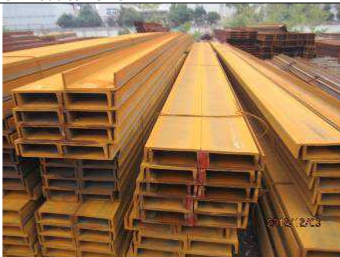
c.1. Photo of Product View(UPN 300#a)