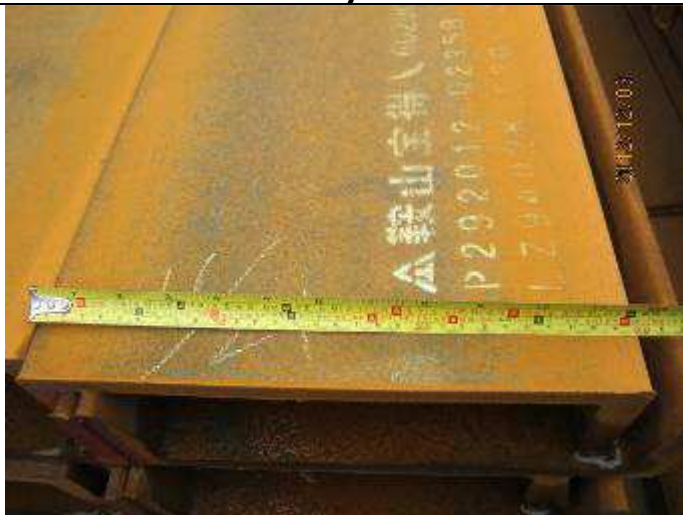
d.1 dimension checking(UPN 300#a)